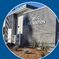
SRJC Foundation New Building Opening—page 4