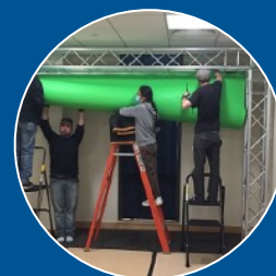
Media Systems hard at work in Doyle Library— page 3