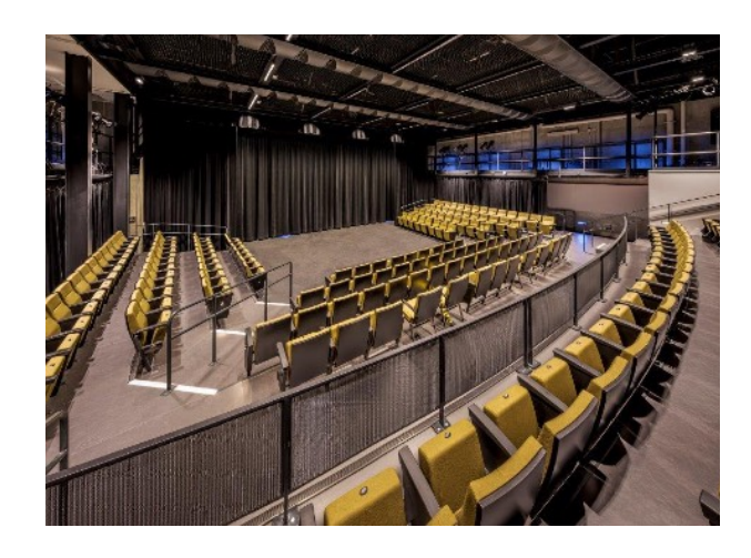
The Burbank Auditorium Modernization, winner of four awards, included the creation of a new 200-seat theater addition. Below, the lobby renovation.