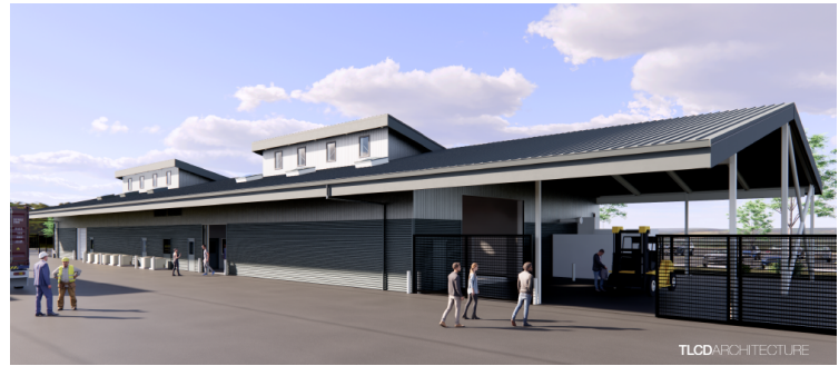
Architectural design of the Petaluma Construction Training Center.

The Petaluma Construction Training Center was the highlight of the Building Futures event that took place at the Petaluma Campus on Saturday, September 23. The Construction Training Center will support rebuilding the North Bay's housing units following the devastating series of recent wildfires. Construction on this project was made possible thanks to an $8.12 million federal disaster grant from the Economic Development Administration (EDA) and local donor Tipping Point with Sonoma County Economic Development Board. In 2022, an additional $4 million grant amendment was awarded by EDA, with a local supporting grant from Bank of America, propelling the project forward. Construction officially started in May with the erection of steel structure and metal roof deck recently completed. The center is scheduled to open for instruction Fall 2024.