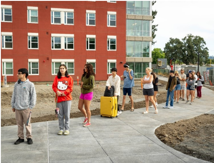
SRJC students lined up to move into their new home at "Polly Hall."