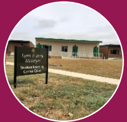
Shone Farm — 3