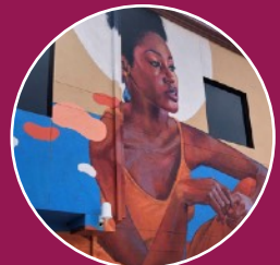
Outdoor WiFi Project — 4