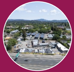
SRJC Student Housing — 2