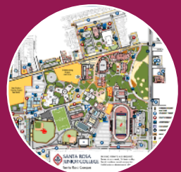
New SRJC Campus Map Available — 6