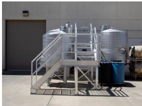
Shone Farm 900-gallon wine tanks acquired through a Strong Workforce State grant.