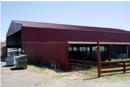
Porter Barn received a new roof and exterior paint, thanks to Measure H.