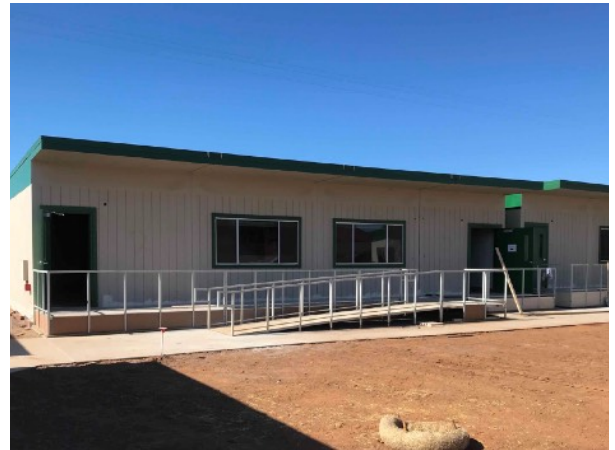
Work progressing on the new concrete walkways in the courtyard between the agricultural portable classroom buildings at Shone Farm