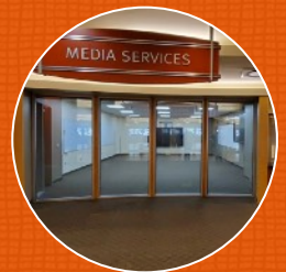
Doyle First Floor Library Media Services Page 4

A Look Ahead at our next issue: Pioneer Hall Intercultural Center